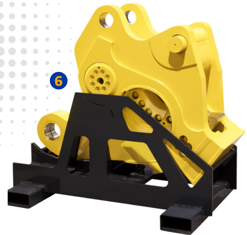
SHEAR JAW STAND